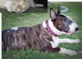
The dogs pictured in this brochure are all previous Rescue dogs!